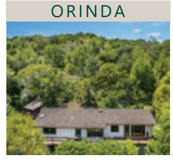
37 & 20 La Madronal A private sanctuary in the Orinda Hills which features two detached residences & 11 separate parcels totaling approximately 4 acres!