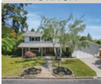
35 San Pablo Court Beautiful 5 bd/ 3 ba traditional home w/ great views, large grassy backyard & sparkling pool!