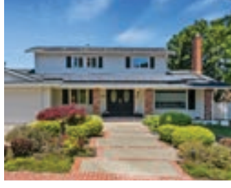
1183 Cedarwood Drive Spacious 4 bd/ 3 ba home situated on large flat lot w/ gorgeous backyard, sparkling pool & multiple outdoor spaces!