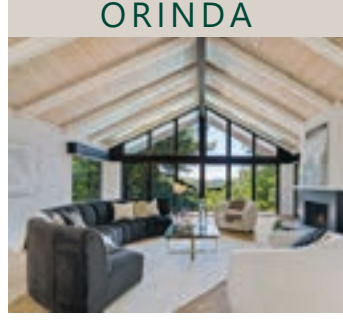
5 Hidden Lane Updated Modern on Sleepy Hollow cul-de-sac. 2616 sf, 3 bd/ 2.5 ba, plus separate 1,012 sf lower level, pool!