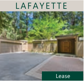
9 Redwood Circle Situated down a private lane, surrounded by majestic redwood trees is this spectacular 5 bd/ 3 ba home!