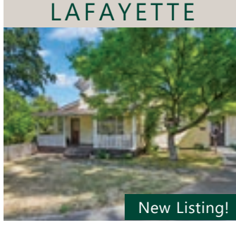
1324 Martino Road Charming Lafayette Vintage home on beautiful .50 acre flat lot w/ 3+ bd/3 ba + separate "carriage house" now a 490 sf office - maybe future ADU!