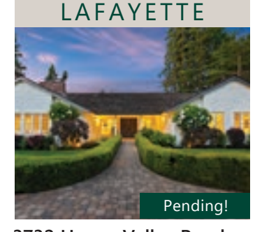
3732 Happy Valley Road Treasured Happy Valley Estate, premier loc, 5 bd/ 4.5 ba, coveted, flat lot. Stunning pool, cabana & views!