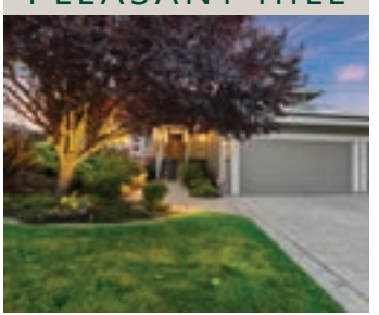
1411 Stonehedge Drive Stunning 3 bd/ 3 ba tri-level w/ fabulous curb appeal is located in the desirable Valley High neighborhood!